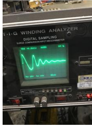
Armature test good