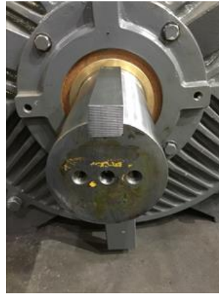
Modified key. Machined height to 1.173.