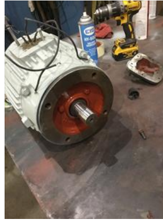
159. Service Technician