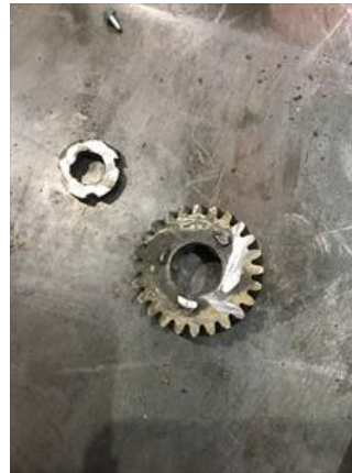
Nut and gear needs replaced