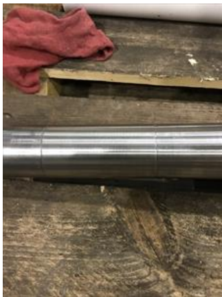
Finish diameter 2.5