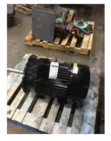
159. Service Technician