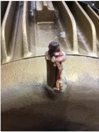
Incorrect lubricant added