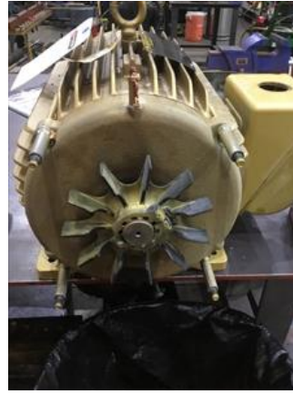
Fan melted from overheating rotor