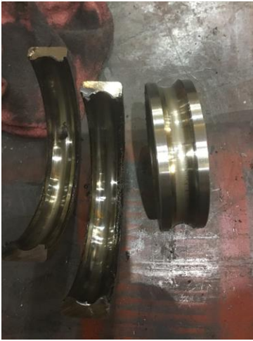
Fluting in de