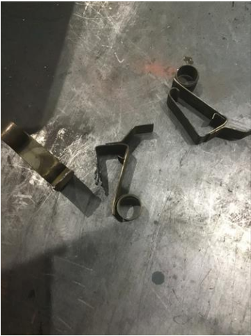
Replace two springs