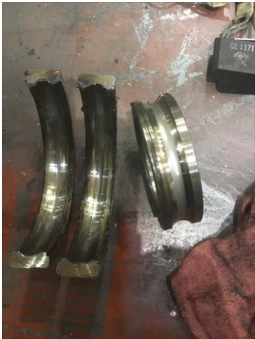
Fluting in ode