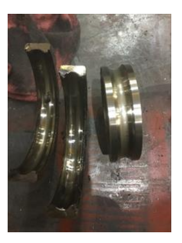
Fluting in de