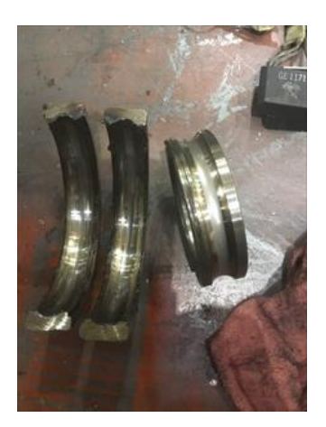
Fluting in ode