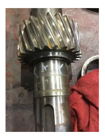
Bearing fit bad