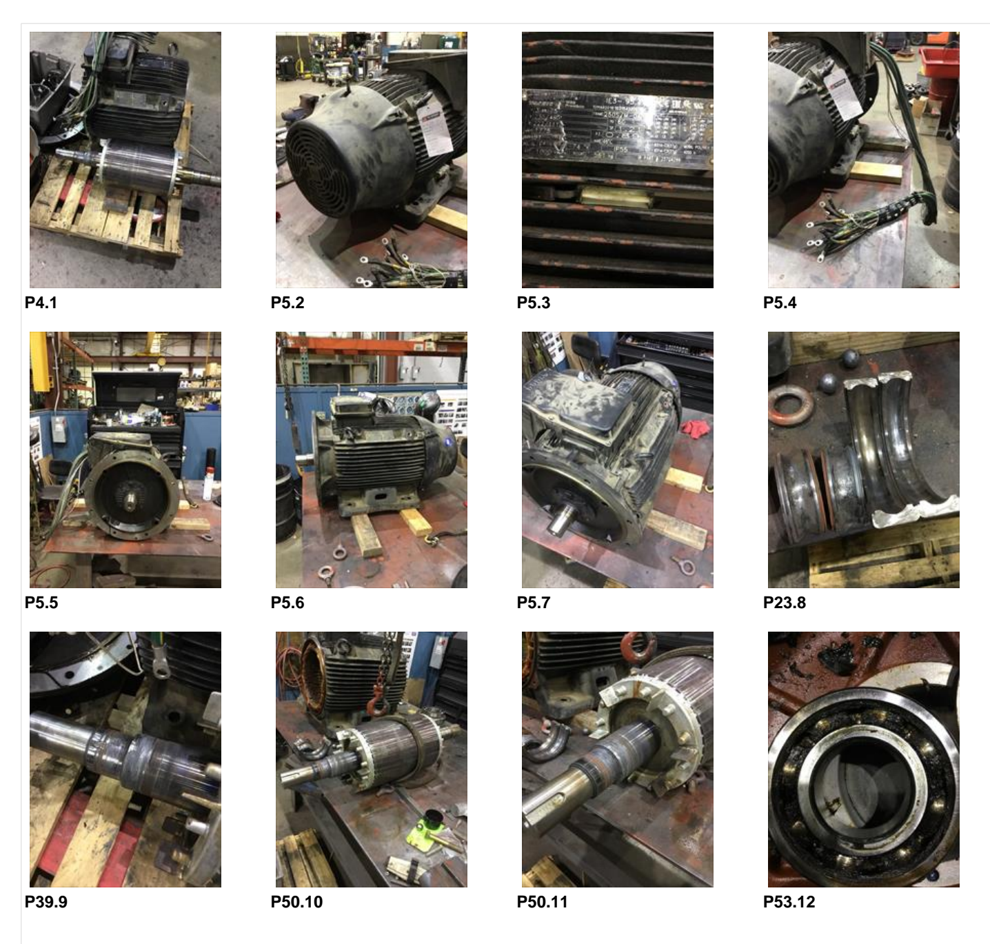
Hi-Speed Industrial Service disclaims all warranties, both express and implied, relating to the information, reports, opinions and analysis disclosed to the Customer by Hi-Speed. Hi-Speed shall not be liable for any errors or omissions, or any losses, injury or damages arising from the use of such information, reports, opinions and analysis by the Customer.