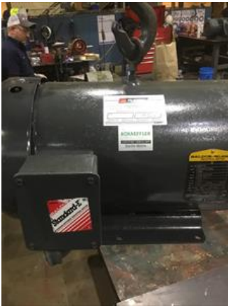
159. Service Technician