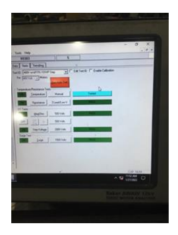
42. Stator Condition