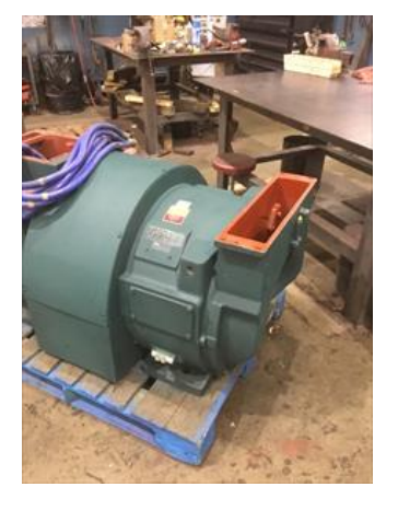
159. Service Technician