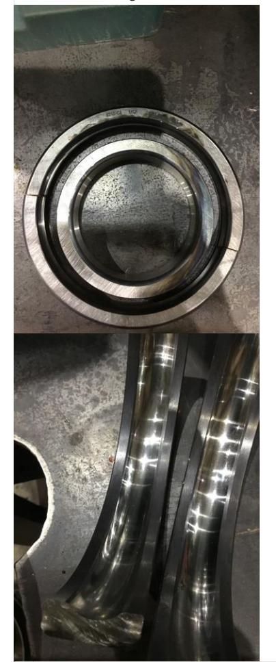
52. Bearing DE Type 53. DE Bearing Qty. 54. Bearing ODE Size