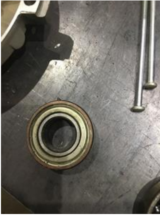
32. Drive End Seal