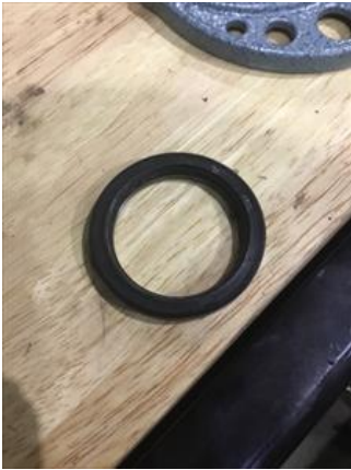
33. Opposite Drive End Seal