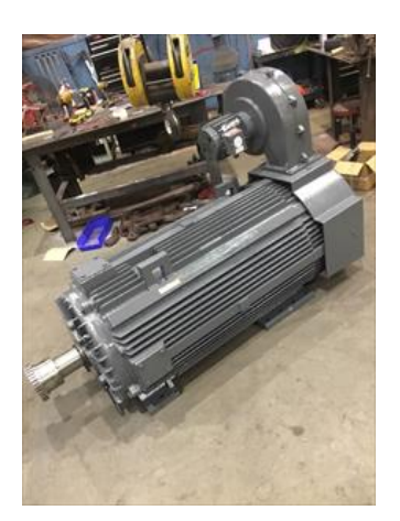
98. Final Pics and QC Review