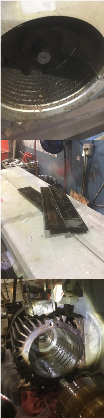
Cylinder has groves needs replaced