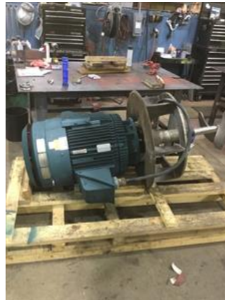
159. Service Technician