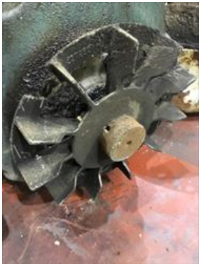
P5.10: Fan Broken