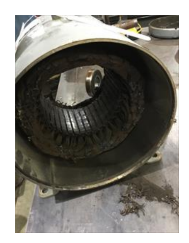
43. Failure Location