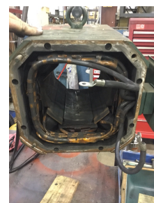
Fields condition image: