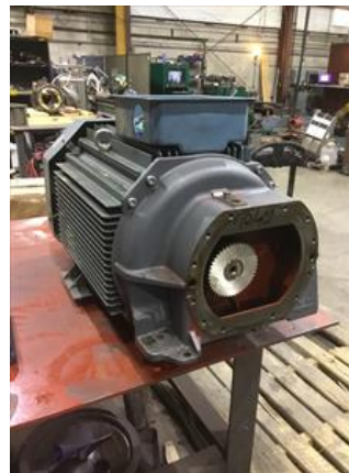
Gear part number facing out