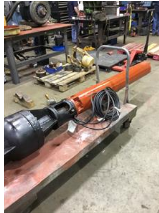
159. Service Technician