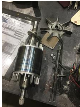
6203 6205 bearing

Hi-Speed Industrial Service disclaims all warranties, both express and implied, relating to the information, reports, opinions and analysis disclosed to the Customer by Hi-Speed. Hi-Speed shall not be liable for any errors or omissions, or any losses, injury or damages arising from the use of such information, reports, opinions and analysis by the Customer.