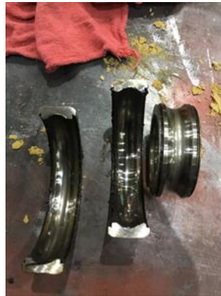
Ageis ring shaft size 2.835