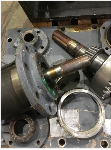
24. Seal Physical Condition