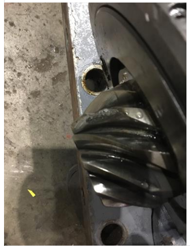
19. Gear Contamination

18. Physical Gear Condition (NA) Not Applicable