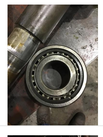
(NA) Not Applicable