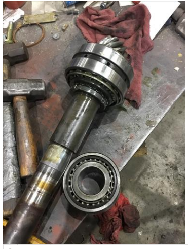
21. Bearing Physical Condition