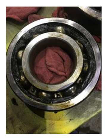
55. Bearing ODE Type56. ODE Bearing Qty.