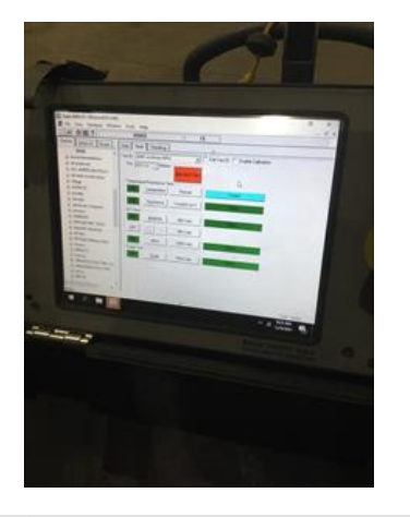
42. Stator Condition