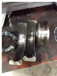
Bearing Make Image