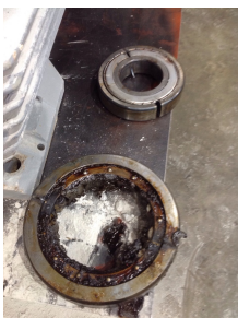
Bearing Type Image