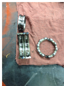
Bearing Make Image