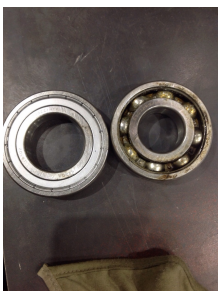
Bearing Type Image