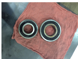
Bearing Type Image