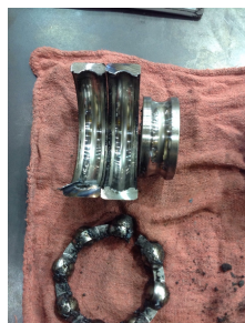
Bearing Make Image