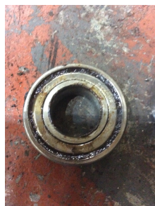
Bearing Make Image