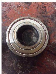
Bearing Type Image