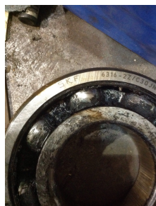
Bearing Make Image