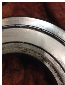
Bearing Type Image