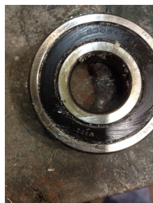
Bearing Make Image