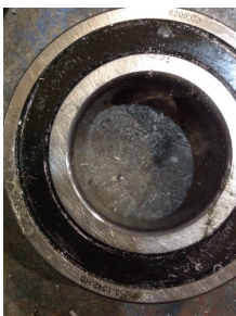
Bearing Type Image