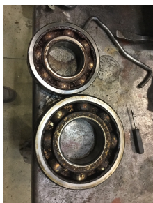
Bearing Type Image