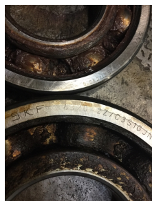
Bearing Make Image