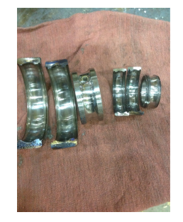
Water jacket: Ok