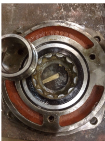
Bearing Type Image