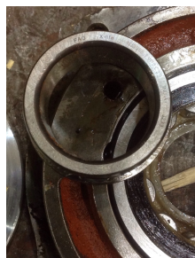
Bearing Make Image