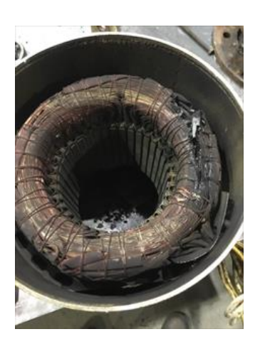
43. Failure Location