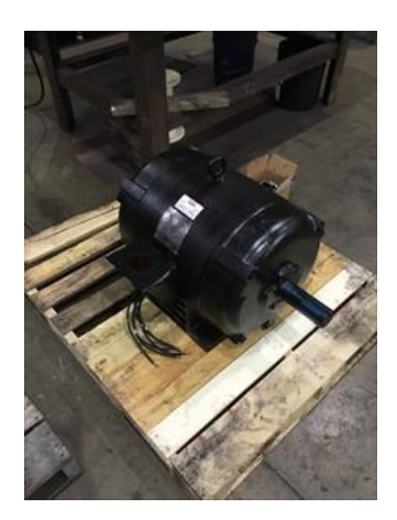
159. Service Technician