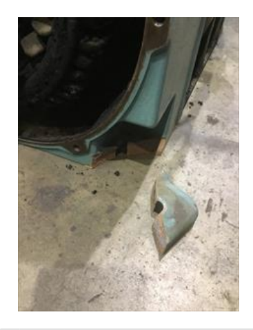
33. Fan Condition