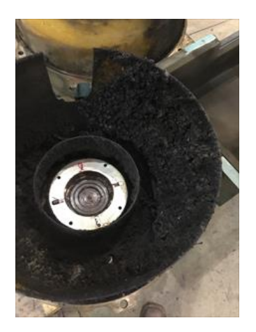
32. Frame ConditionFoot is broken