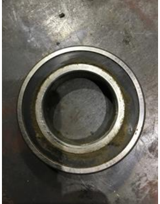
54. Bearing DE Type