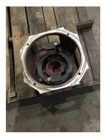
36. Broken or missing components