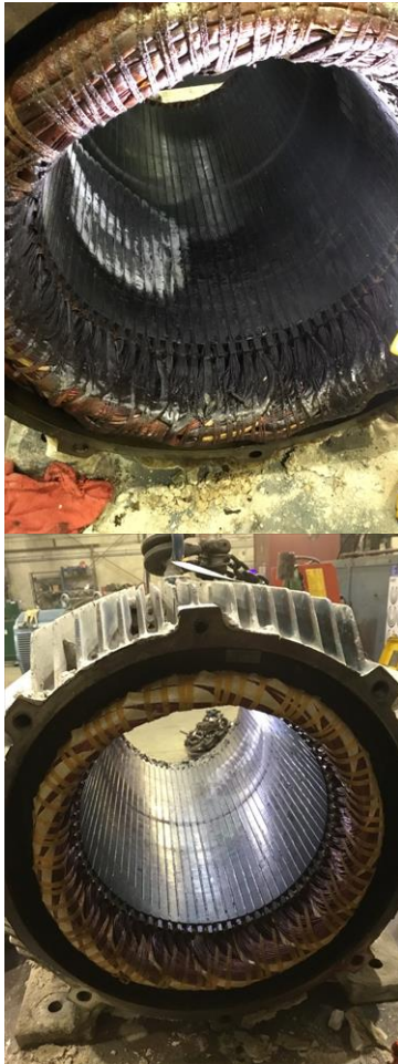
Initial Rotor Inspection