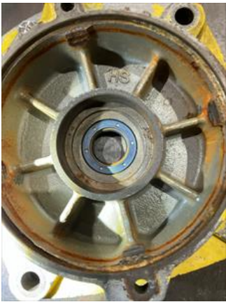
47. Opposite Drive End Seal