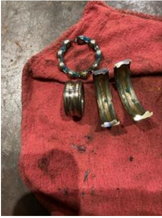
46. Drive End Seal