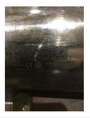
3. Photos of all six sides of the machine.