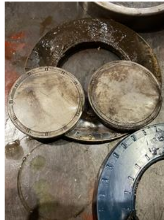
100-12 seal caps