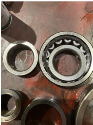
3 pice roller bearing