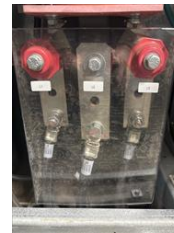
BWE 1 before