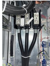
Extruded 2 before