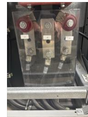
BWE 3 after