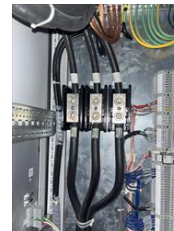
Extruded 1 before