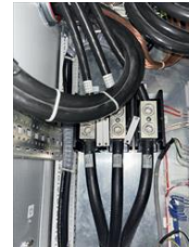
Extruded 2 after

Hi-Speed Industrial Service disclaims all warranties, both express and implied, relating to the information, reports, opinions and analysis disclosed to the Customer by Hi-Speed. Hi-Speed shall not be liable for any errors or omissions, or any losses, injury or damages arising from the use of such information, reports, opinions and analysis by the Customer.