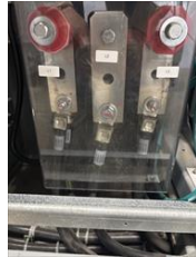
Picker 2 after