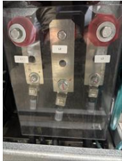
Picker 2 before