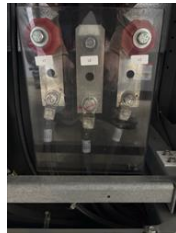
BWE 2 before