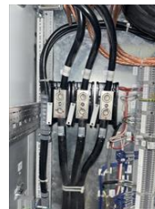
Extruder 3 after