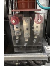
Picker 3 before