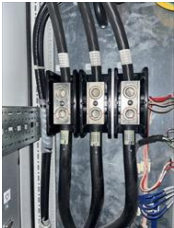
Extruded 1 after