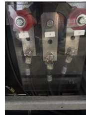
BWE 2 after