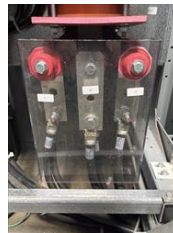
Picker 1 after