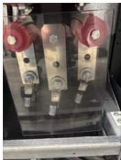
Picker 3 after