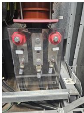
Picker 1 before