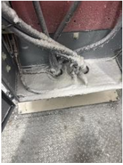
Picker 1 disconnect