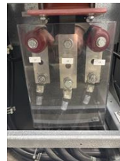
BWE 3 before