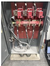
Disconnect picket 2