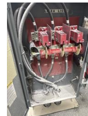
Picker 1 disconnect

Hi-Speed Industrial Service disclaims all warranties, both express and implied, relating to the information, reports, opinions and analysis disclosed to the Customer by Hi-Speed. Hi-Speed shall not be liable for any errors or omissions, or any losses, injury or damages arising from the use of such information, reports, opinions and analysis by the Customer.