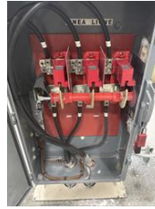
Picker 1 after clean disconnect