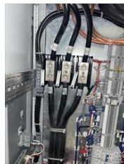
Extruder 3 before