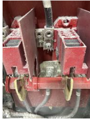
Picker 1 disconnect