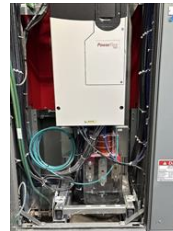
Extruder 6 after