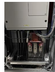
BWE 1 before