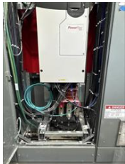
Extruder 6 before