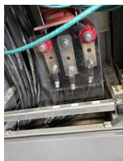
Extruder 5 after