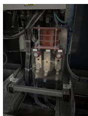
BWE 2 after