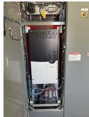
BWE 6 before