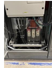
BWE 5 before