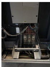
BWE 2 before