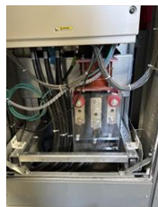
BWE 6 after