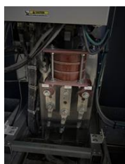
Picker 2 before