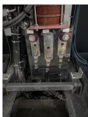
Picker 6 before