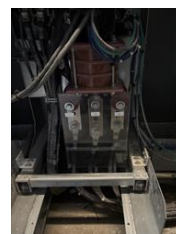
Extruder 1 after