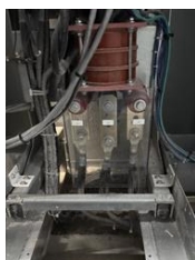
Picker 1 before