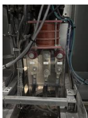
Picker 5 before