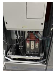
BWE 5 after