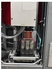
Extruder 5 before