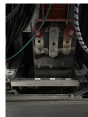
Extruder 2 before