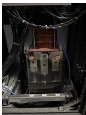
BWE 1 after