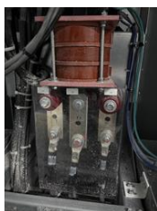
Extruder 2 after. L3 buss bar is loose inside the VFD