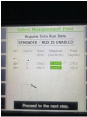
Baghouse fan is good