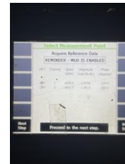
2PM Bel Bond