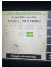
2 Mach fan is good