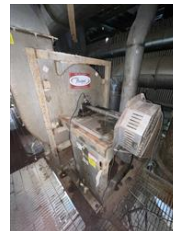
2PM Bel Bond