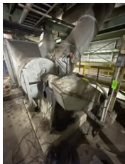
2 Mach fan