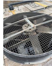
Supposed to look like this