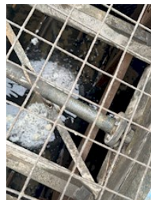
Not supposed to look like this