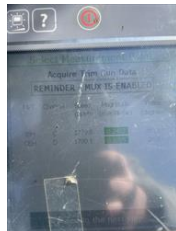
Combustion blower final readings