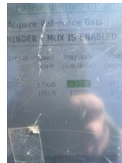
Combustion blower initial readings